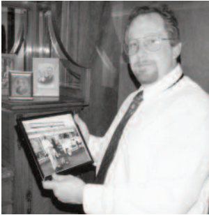
'This can save your life.'

'I know these two products could have saved my Dad from dying of Colon Cancer.'