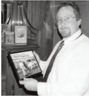
'This can save your life.'

'I know these two products could have saved my Dad from dying of Colon Problems.'